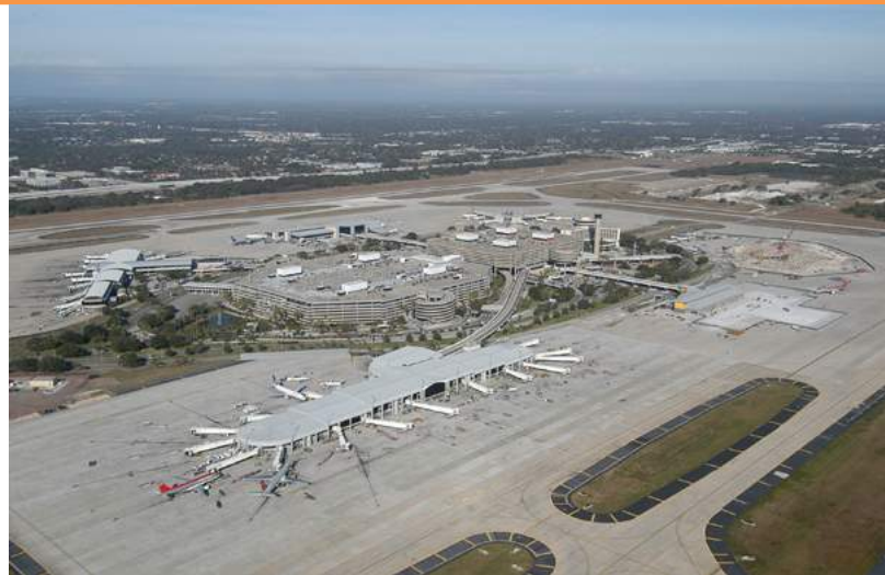
Below: Airport panorama.

The train features a unique design inspired by the beauty of the Tampa Bay region. In collaboration with the Audubon Society, each of the 12 cars is adorned with an image of one of the many birds that inhabits the Tampa Bay region. Mitsubishi Heavy Industries America, Inc., which is building and operating the automated train system, calls the exterior design one of the most unique in the world. The tour will include a look at the legacy Bombardier system and the new SkyConnect system operated by Mitsubishi.